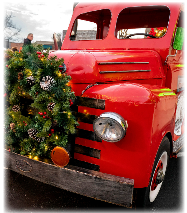
Cover Picture: Home Sweet Shawnee: A Place Like No Other!

This document, meeting agendas and packets, and information about Shawnee, are available at cityofshawnee.org .