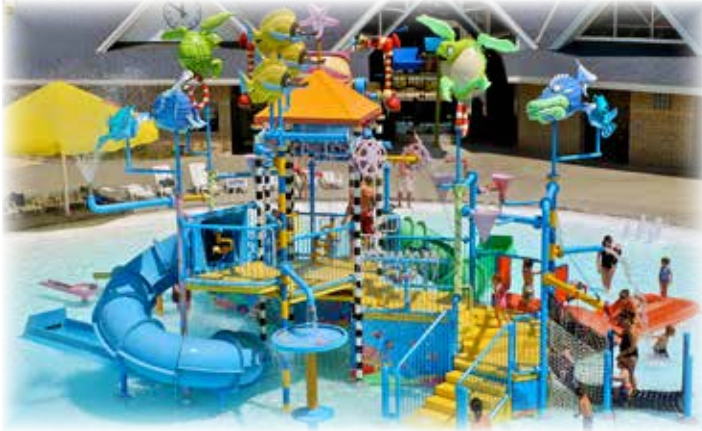
Splash Cove at the Jim Allen Aquatic Center 5800 King • (913) 631-7177