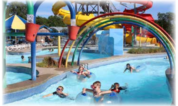
Thomas A. Soetaert Aquatic Center 13805 Johnson Drive • (913) 631-0054